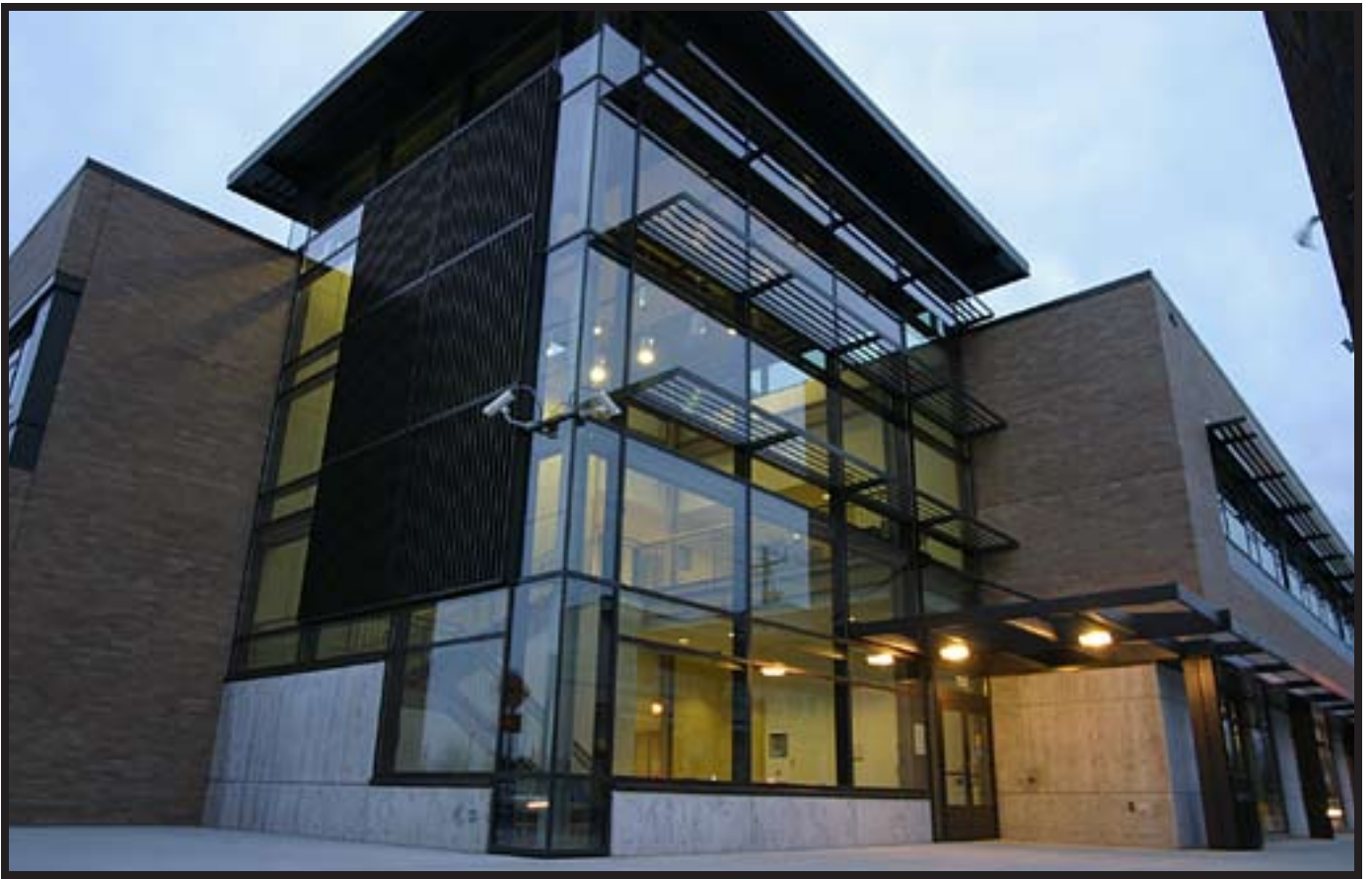
The Daniel F. Moriarty Arts and Humanities Building