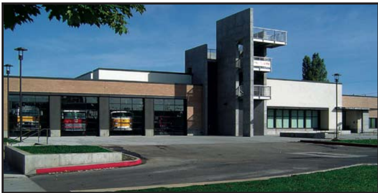
The Public Services Education Building