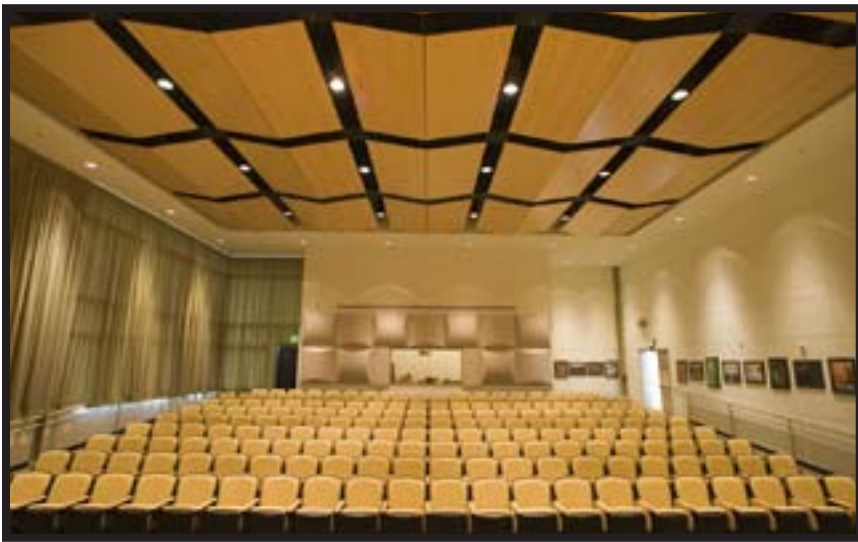
Auditorium in the Daniel F. Moriarty Arts and Humanities Building