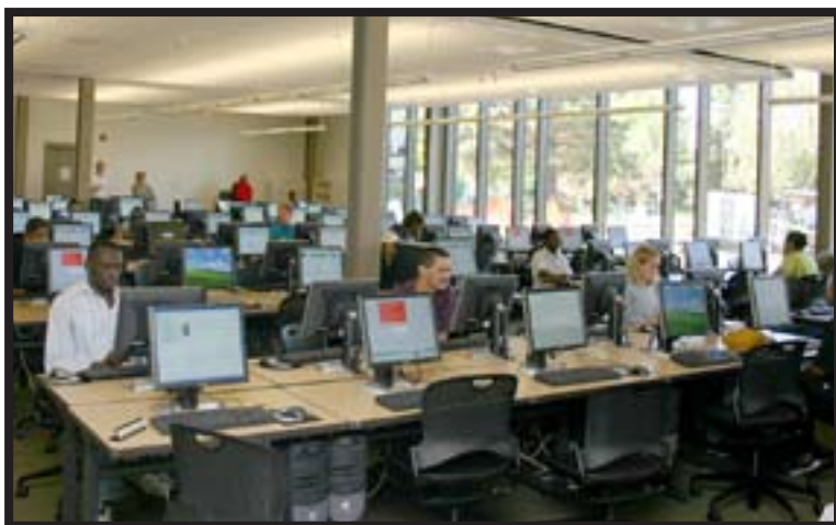
A multi-media classroom in the Technology Education Building