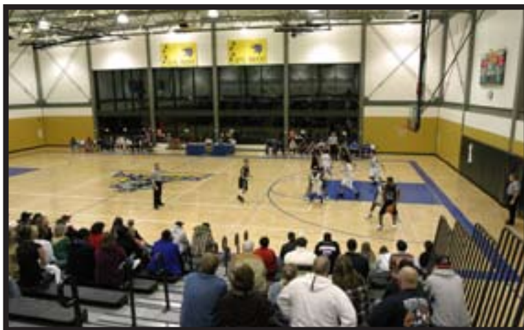
A Panther's game in the gym of the Physical Education Building

While a tremendous amount of work has changed the entire look and feel of the site, the construction isn't over. On the horizon, the modular trailers will be removed from the area near the Student Services Building and renovations are under way at a building near the campus and recently purchased by PCC for new Department of Public Safety offices.