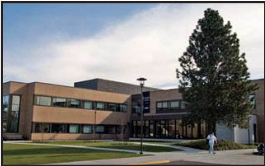
The Technology Education Building