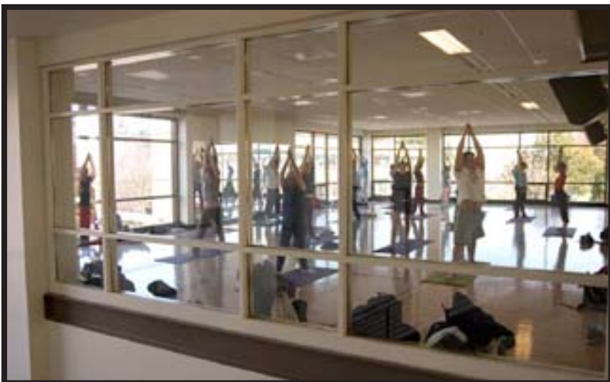
A yoga class in the Physical Education Building