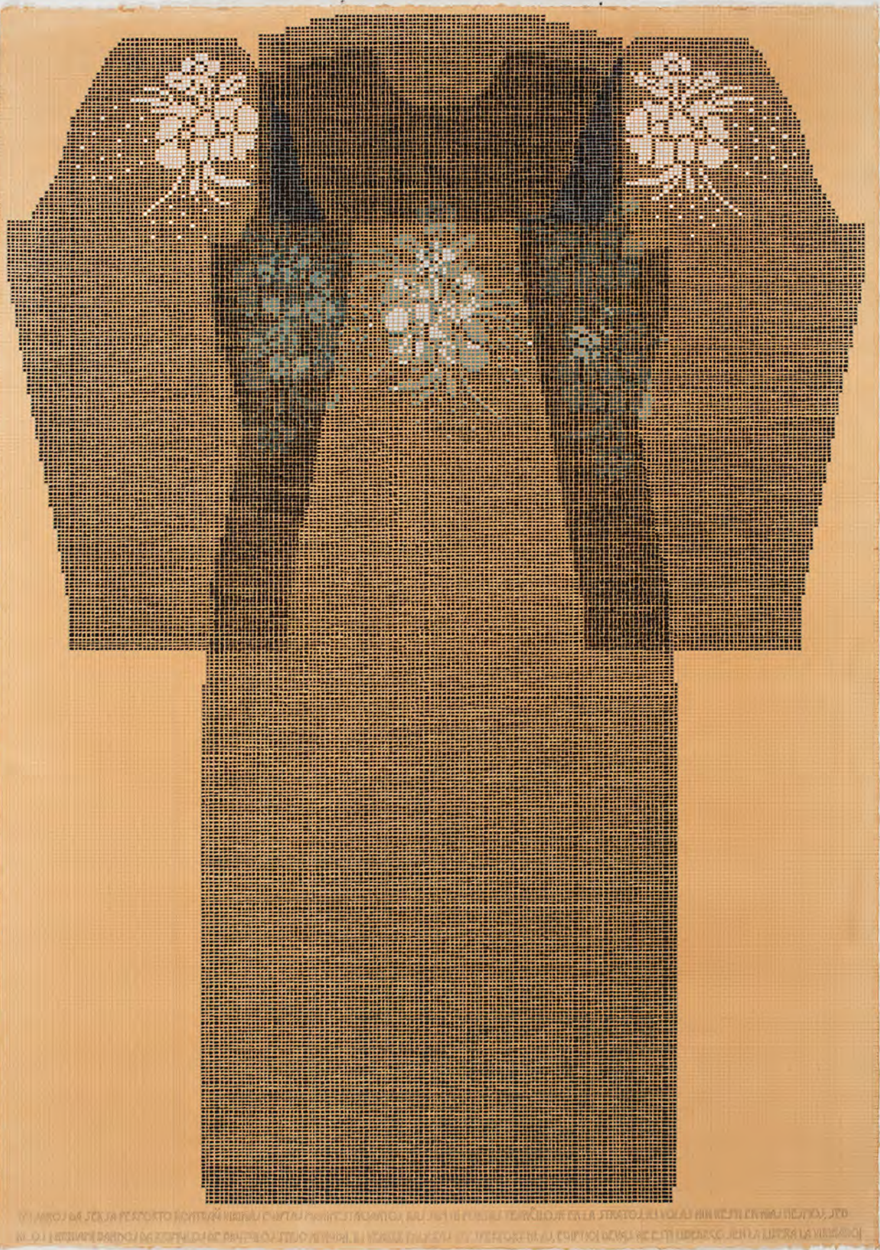
"DU JAROJ DA SEKSA PERFERTO KONTRAŬ VIRINAJ EGIPTAJ MANIFESTACIANTOJ, KAJ JAM NI PORTAS TRANĈILOJN EN LA STRATOJ," 2014, GOUACHE AND GRAPHITE ON TEA-STAINED PAPER, 30 X 41 IN.