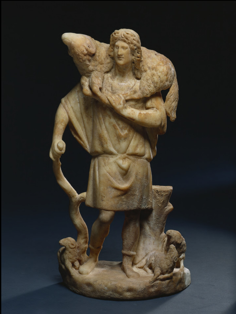
The Good Sheperd 270 – 280 CE