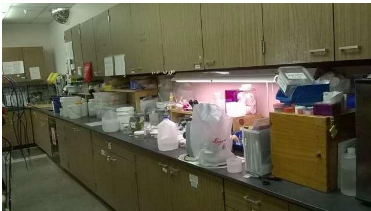
Figure 3. The laboratory prep area at Sylvania Campus.