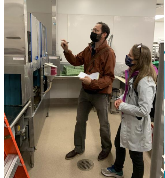
Dishwasher exhaust fan found on, should only run when dishwasher is in use, but kitchen staff was using it to ventilate the area.