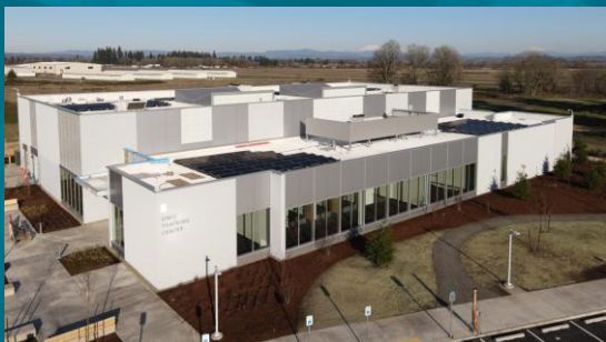
New Omic Center, a LEED Silver building