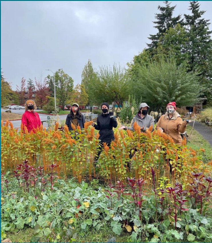
Sustainability Team Retreat-Sylvania Learning Garden 9.2021