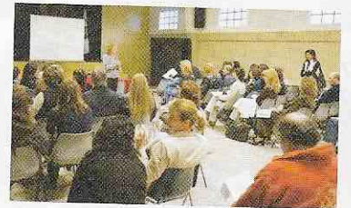
parent-teacher organization (PTO)