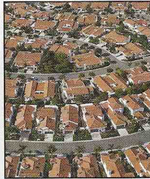
One of Springville's new housing developments

New residents say they moved to Springville because of the warm weather, jobs, low cost of living, and natural beauty. The area is popular with people from the large, expensive cities of the Northeast and the West Coast. "We moved to Springville last year.