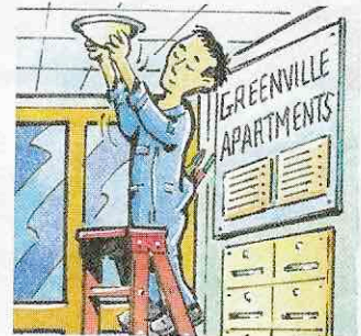
a building manager