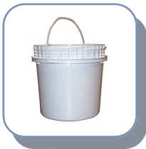
EXAMPLE STORAGE CONTAINERS