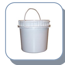
EXAMPLE STORAGE CONTAINER

1. Place waste aerosol cans in sturdy, closable, plastic containers.