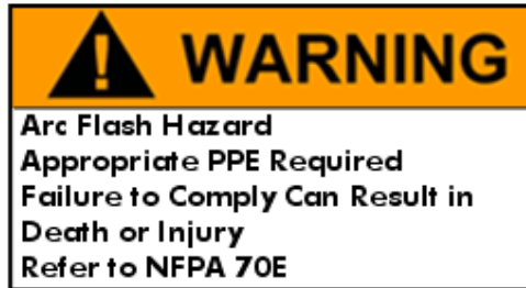
Minimum arc flash label example