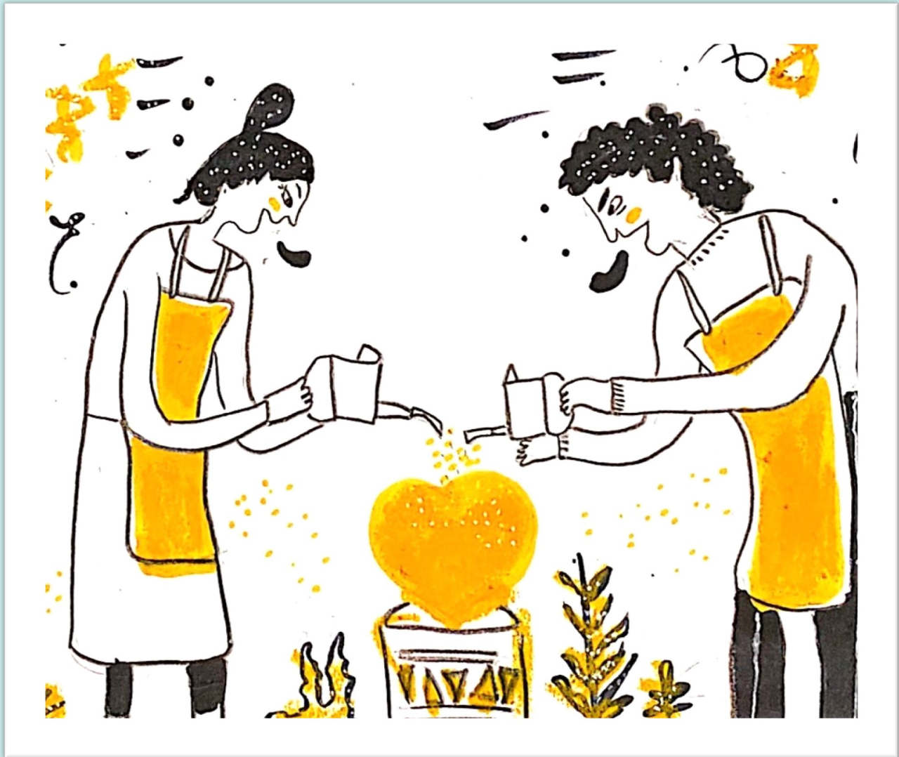
Drawn By: Samila Albuquerque

compliments. They prefer young girls to leftover girls no matter the age. Although many girls like this category, their parents can't accept them. After all, all parents hope for is their children's happiness and parents know more about marriage than we do. However, some unmarried girls will still whimsically hope to be introduced to such boyfriends. Youth will pass away, then beautiful faces will also have an old day because a marriage without love is not reliable.