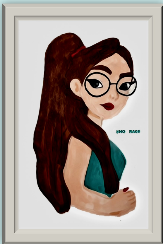
Cover Artist: Nora Alqara