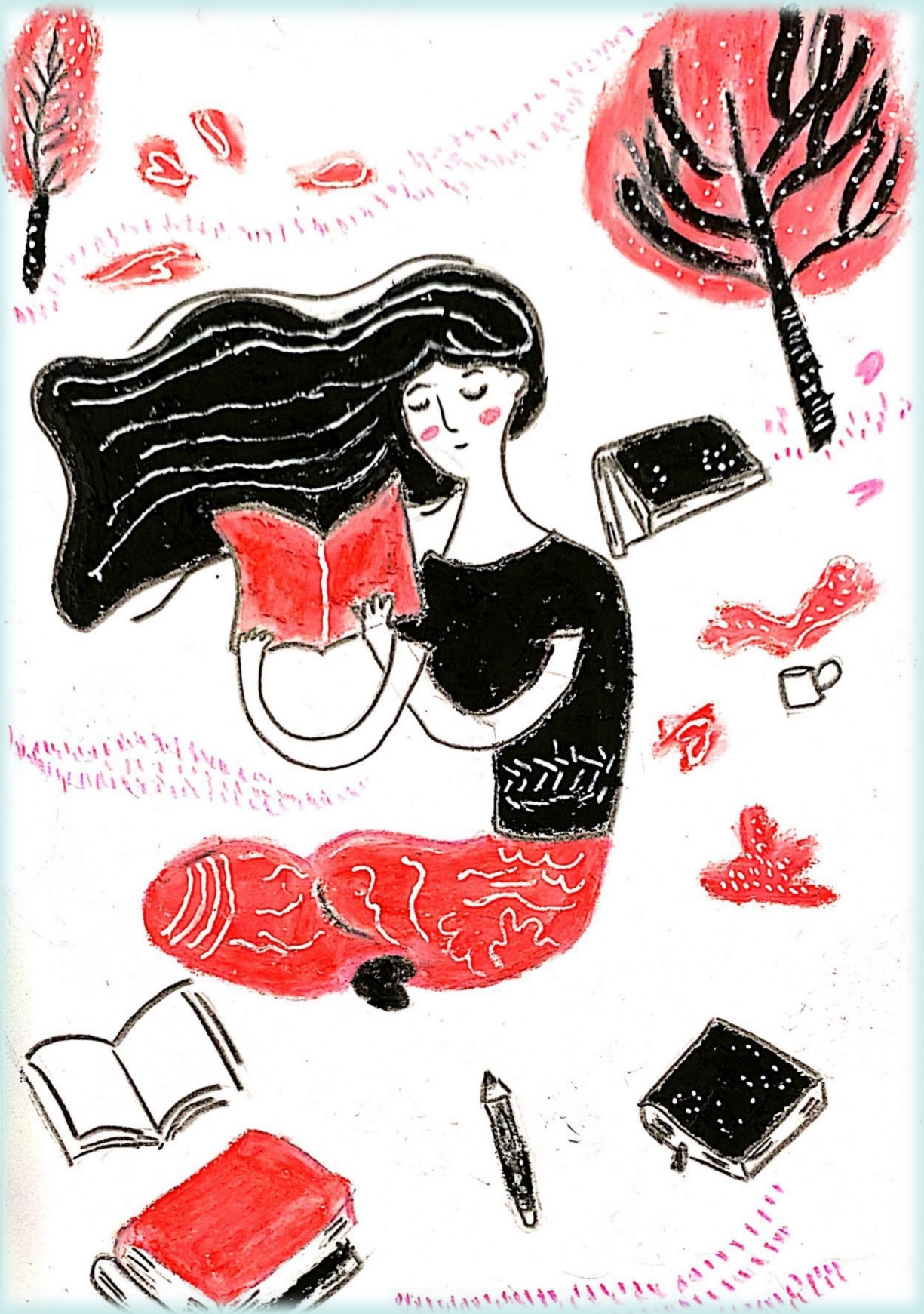
Drawn By: Samila Albuquerque