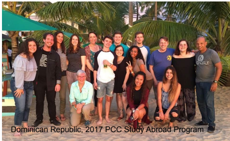
Dominican Republic, 2017 PCC Study Abroad Program