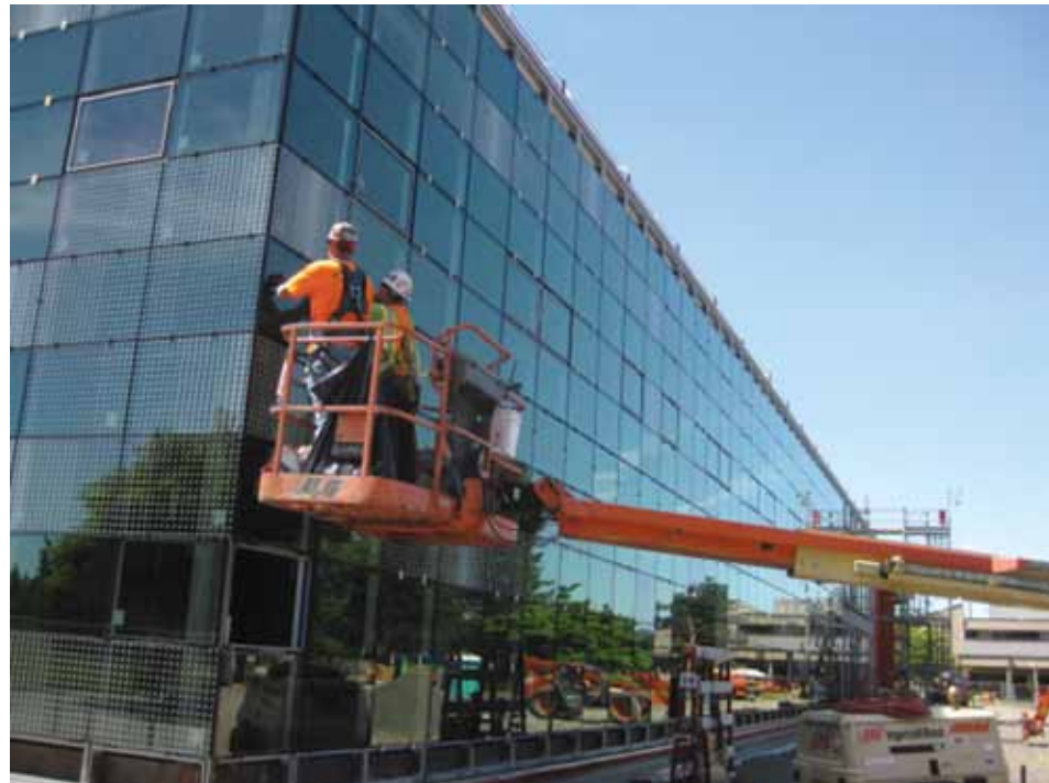
Above: Benson Industries, sub-contractors to Fortis Construction, install external fritted glass panels that will shield sun while allowing light into the new addition to Building 7.

AS OF FALL 2013: The exterior glass skin is complete and interior work on Building 7, including framing, mechanical, electrical and plumbing as well as furniture selection for student study spaces is on track for the spring 2014 opening. Washington County Clean Water Services approved the detention pond revitalization plan and over 47,000 new plant plugs are in the process of being planted to help better manage storm drainage. Building 5 final design and programming and work with the County on future transportation improvements to Springville Road continue.