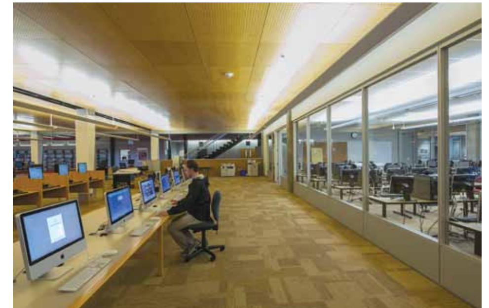
Completed renovations introduce new integrated computer resource and tutoring centers into the library.

THE MAJORITY of the bond work at the Sylvania Campus is renovation and is being performed by Howard S. Wright Construction, the college's construction manager/general contractor for the Sylvania Campus. This means that construction crews must work on a compressed summer schedule to get as much done as possible during the summer to minimize disruption during the busy academic year. By the end of summer 2012, the new Automotive Storage building, complete renovation of Science Technology (ST) chemistry labs and office spaces, upgrades to the existing lap and diving pools in the Health Technology (HT) and the major Library renovation were all ready for the start of the fall 2012 term.