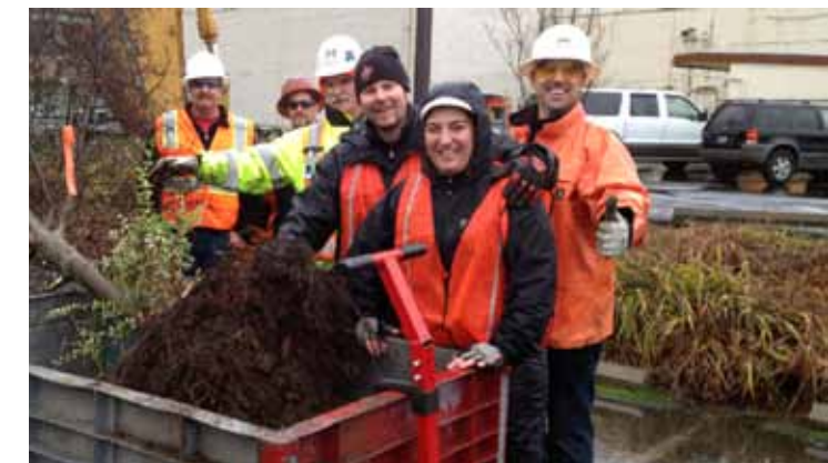
Left: Hoffman Construction crew members help community members dig out and bundle up free plants and trees.

AS OF FALL 2013: The construction plan, along with good weather, has enabled construction to proceed quickly. Completion of the underground parking structure initiated construction of the new academic building and student center. The Campus Construction Learning Center (the former Paragon Club) opened with Hoffman Construction taking residence and neighborhood organizations welcoming the new meeting facility. New building access controls and cameras were installed in existing campus buildings, facilitating similar safety improvements throughout the college.