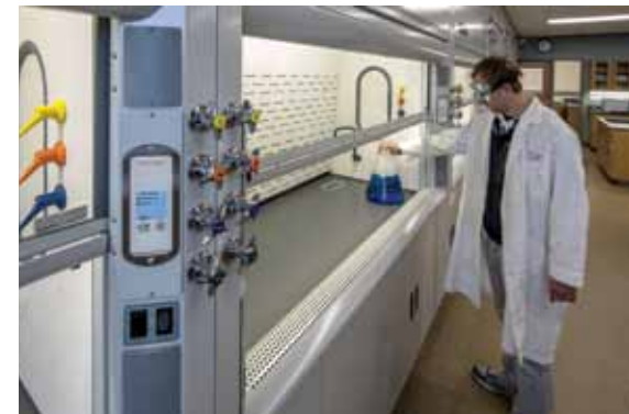
Howard S. Wright construction crews worked within the narrow summer window to completely remodel the chemistry labs.

With space made available to temporarily house those displaced by the first phase of major improvements to the College Center (CC), design, pricing, final construction documents, bidding and permitting proceeded throughout the fall and winter months. Construction also took place on the ground floor of the HT building to accommodate Campus Technology Services, which had been housed in the soon to be renovated southeast corner of the CC building. In other work, the campus administration areas were improved, a new information desk was created adjacent to these quarters and construction began on the new exterior elevator on the north side of the CC building. The elevator, anticipated