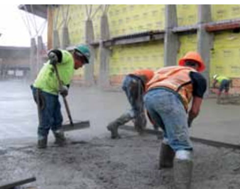
Left: Literally up to their knees in concrete, Faison, a local minority owned business, and Whittaker Construction crews lay the foundation for the new addition to Building 7. The bond program is committed to hiring local MWESB (minority, women-owned, or emerging small business) firms as part of its goal of providing local jobs and advancing skills in the workforce.