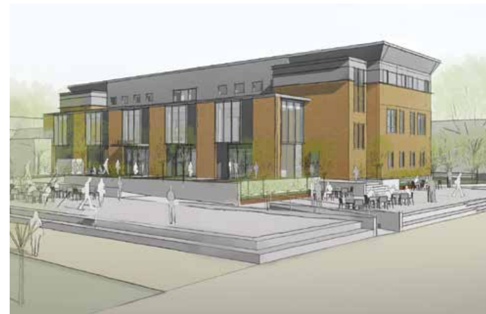
Above: An architect’s rendering shows the remodeled Library and new plaza that are scheduled to be completed in 2016. The improvements will include new bathrooms on both floors, a new computer classroom, and a balcony overlooking the new common space below. The entry also will be refined and moved to the north side of the building.