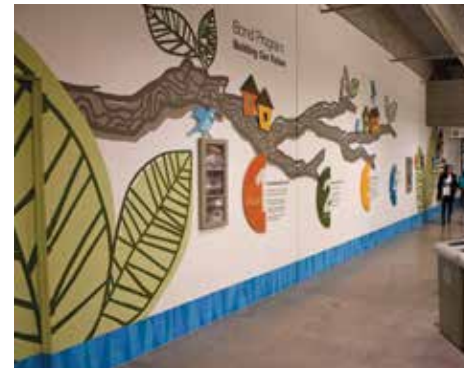
Above: Second-year graphic design students at PCC Sylvania used a temporary construction wall in the College Center as an opportunity to develop their skills and inform the campus community about the four phases and goals of the Bond Program.

ible meeting space as well as a home for the campus’ prized—and newly restored—“Welcoming Pole.” Looking forward, a new stormwater detention facility—long of interest to area residents—is being installed at the south end of Parking Lot 5. This work is expected to be completed fall 2015. In the Health Technology Building, the radiography equipment is being updated, and 23 dental chairs replaced. Phase II of CC work began summer 2015 and includes the installation of a large skylight in the upper mall between the Information Desk and the Environmental Center. Offices for several groups are scheduled for remodeling, including: Testing Center; Counseling Center; Career Exploration Cen-