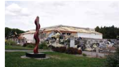
Above: Demolition of 22,000 square feet of Building 5 took place in August 2014, while the existing gymnasium was left intact.