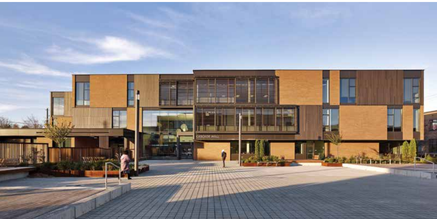
Above: Cascade Hall, the campus’ new academic building, and Student Union were designed to work well as institutional facilities but also to fit well with the surrounding residential neighborhood.