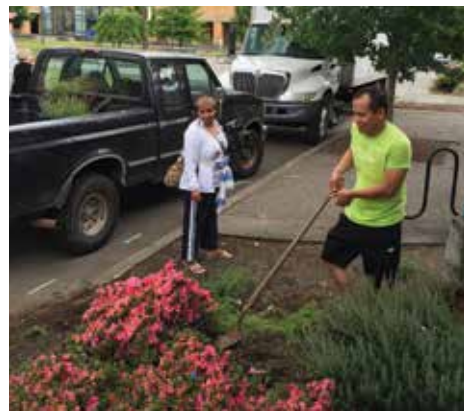
Above: On Free Plant Day, Cascade neighbors were invited to bring a shovel to dig up and take home the landscaping left homeless by the demolition of the Student Center.

swer Center and improved space for financial aid services, and remodeling the Library. The adjacent Student Center was demolished to build a large plaza that will open up the east end of the campus and create a center of activity for students and community events. A Free Plant Day was held for residents who wanted to “adopt” trees, shrubs and other landscaping that was displaced by the construction.