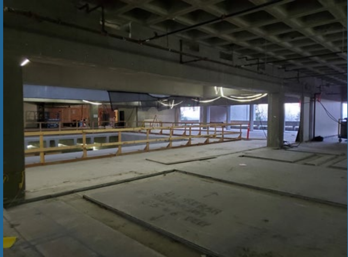
Guardrail at opening