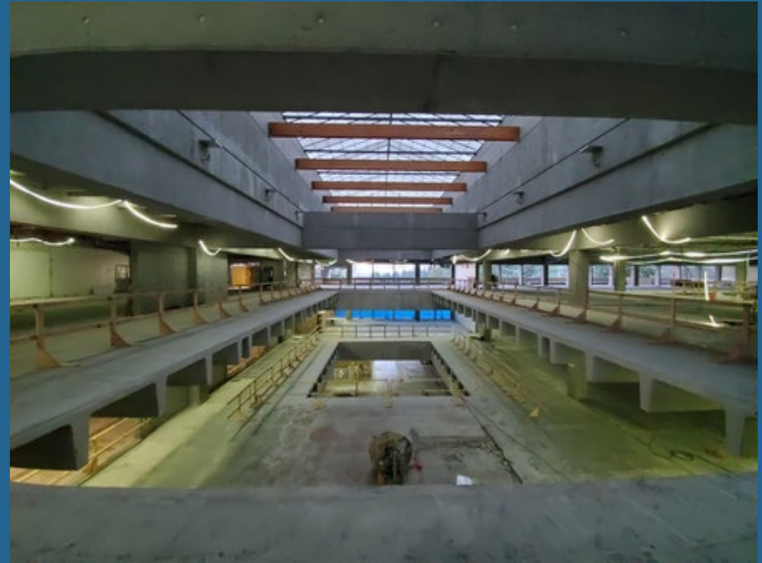
Site fencing @ North Entry