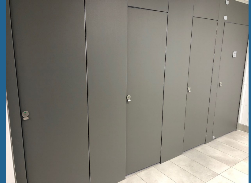
ADA shower and Full Height Toilet Partition @ HT All User Restroom