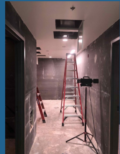
All-user restrooms in level 2