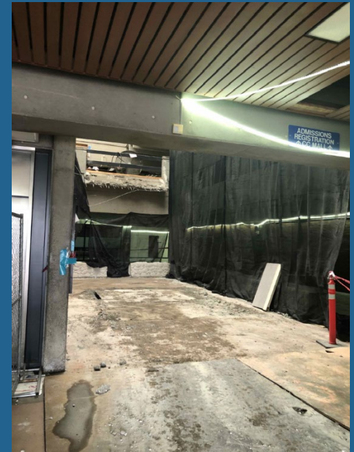
Dust control @ interior lobby