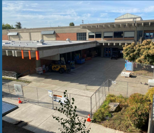
Site fencing @ South Entry