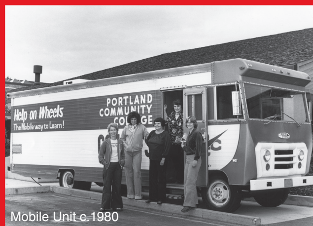
Mobile Unit c.1980