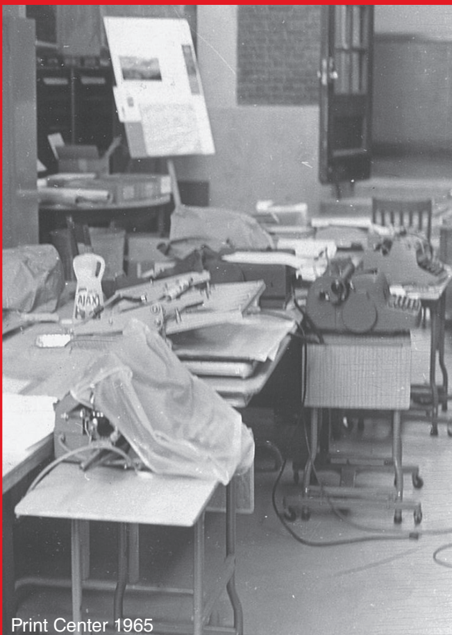
Print Center 1965