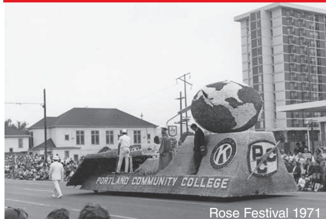
Rose Festival 1971