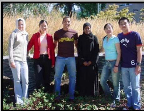
The MC student leaders pose after the Fall 2005 leadership training.

Peer tutoring supports student success and helps build confidence both in and out of the classroom.