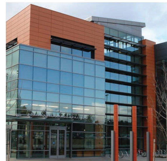
PCC Willow Creek

All are invited to share their thoughts on the bond program and that includes all of the loyal alumni and retirees who know the college so well. Take a moment to view the evolving bond website at bond.pcc.edu , or write to bond@pcc.edu if you would like information, have suggestions or want to get involved.